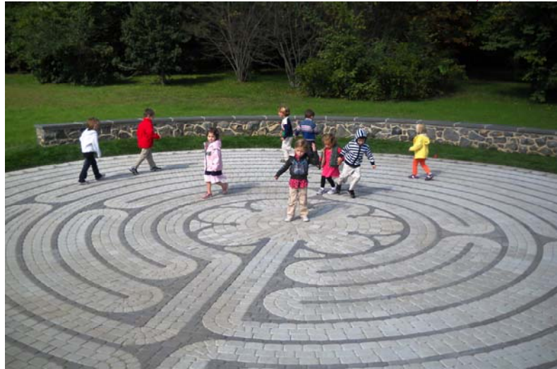
Pre-K on the Labyrinth